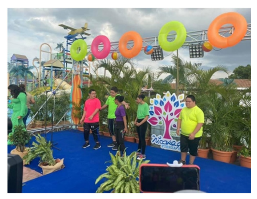
Figure 5. Art, culture, and tradition with inclusion

Contributing to the progress of human development, programs and projects have been promoted to facilitate an inclusive education in culture of artistic expressions through its cultural centers, an example of this is that the municipal dance company has as its motto "Art, Culture and tradition with inclusion".