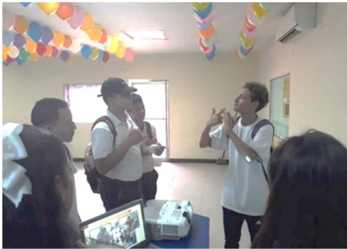
Figure 1. Integration of hearing and hearing impaired students at the Miguel de Cervantes High School.