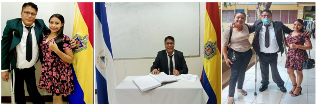
Figure 3. A student with motor disabilities of the Banking and Finance Major in his Bachelor's Degree defense.

Source: Own elaboration. Taken from the Department of Accounting UNAN Managua.