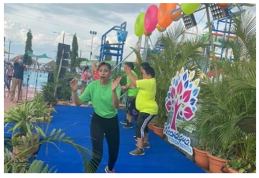
Figure 4. Inclusiveness of the Municipality

The Law of Municipalities grants Local Governments, powers to promote the integral development of the municipalities, in all the competencies of matters that have an impact on socioeconomic development and specifically provide attention to the population through the creation of cultural and community centers, as well as the maintenance of the infrastructure of parks, squares parks, boulevards, leisure and recreation areas, libraries, museums.